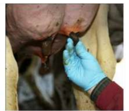
Cleaning teat ends