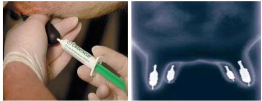
Figure 3: Use of teat sealant in each quarter of an udder