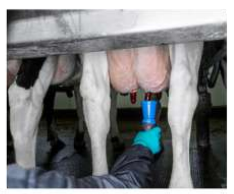
Post-milking teat dipping