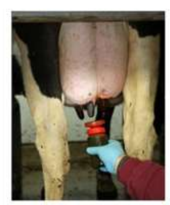
Pre-milking teat dipping

International Journal of Pharmaceutical Research and ApplicationsVolume 5, Issue 2, pp: 550-556www.ijprajournal.comISSN: 2249-7781